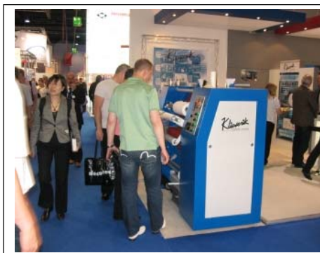
Advanced machines on display at Techtextil 2011

He added that "smart textiles, or functional textiles will become increasingly important with more applications, such as water-repellent and self-cleaning textiles with applications in the automotive sector."