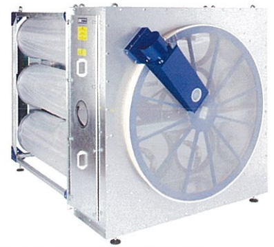
Compact Drum Filter with prefilter.

If multi-stage filtering is required, the Compact Drum Filter can be supplemented with a coarse filter. This rotating, continuously cleaned filter disc is particularly suitable for exhaust air with a high fibre and particle content of various materials, sizes and shapes.