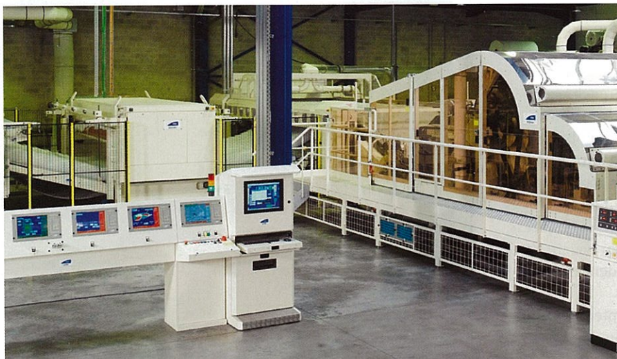
NSC turnkey nonwoven carding line.

Heal’s Elmatear 2, meanwhile, is a powerful and versatile digital tear tester for accurately testing textiles,