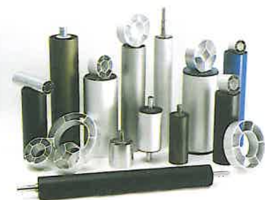
Roll Concept's Alveotubes.

Roll Concept's Alveotubes® are used as Idler, transducer, accumulator, guide, contact, nip, dancer, lay on, calender, reel spools, roll cores. The range includes simple profile, but can offer readily installed solutions with a choice of mountings, coatings and coverings, notably anti-adhesive coatings, in order to avoid stickiness of the roll, when the product is hot.