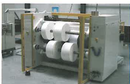
Calemard Slitter Rewinder.

Calemard is an expert in the designing / manufacturing of in-line and off-line slitting and rewinding machines. Calemard