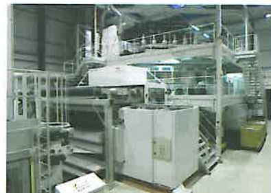
Rieter Perfojet spunjet line.

Its expertise in this range of technologies makes Rieter the only machinery supplier able to offer all nonwovens technologies from a single engineering source. Rieter's ability to engineer customized production lines incorporating multiple technologies brings innovation to the nonwovens industry. Above all, it provides customers with competitive advantages of the market. With more than 150 nonwovens references installed, Rieter is one of the main players in nonwovens industry.