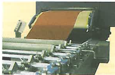
Dollfus & Muller printing dryer conveyor belt.

Established in 1811, this manufacturer developed new high performance compacting felts for knitted fabrics finishing. The new design has been studied in order to obtain the best performances from the compacting machine and the longest possible life from the felt.