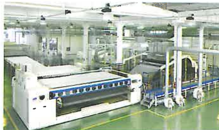
Overview of Asselin-Thibeau line.

are equipped with a supervisory control assistance system, which includes production recipes, maintenance and assistance to line management. NSC nonwoven is a worldwide, major supplier of