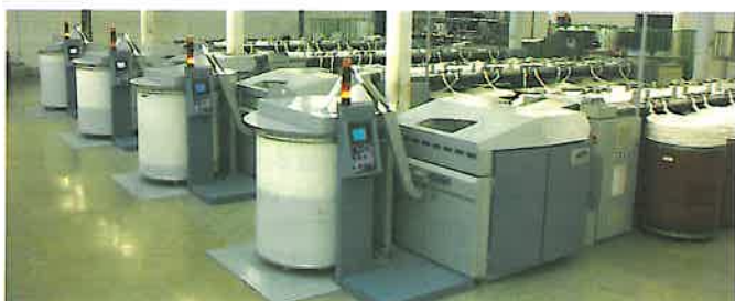
NSC - Schlumberger.